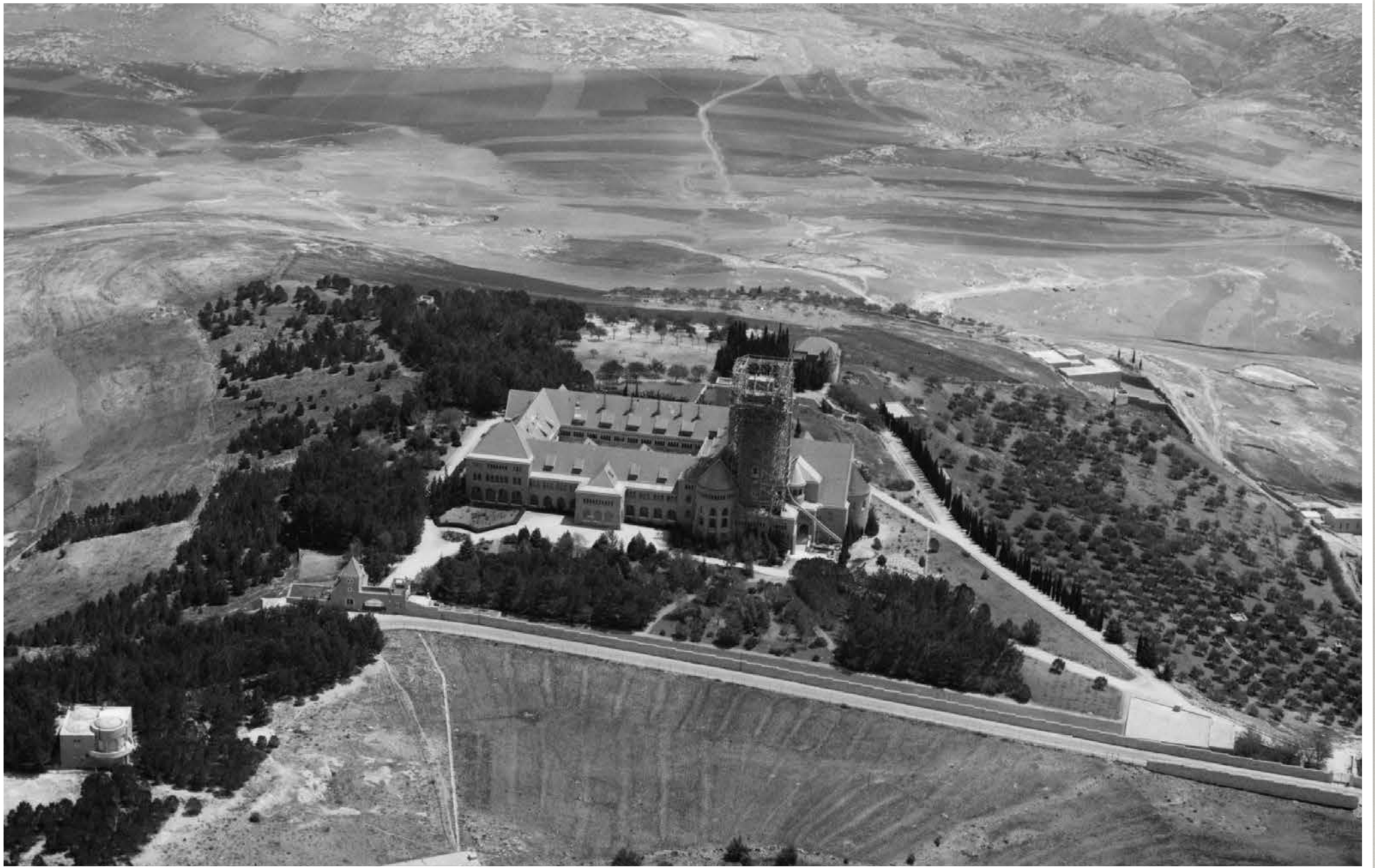
AUGUSTA VICTORIA AERIAL PHOTOGRAPH